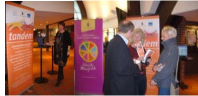
Stavanger Kommune's representatives providing information material

presented to stakeholders and VET organisations. Some 700 VET representatives, stakeholders and policy makers were addressed.